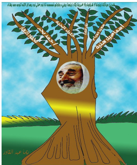
Issue 121, April 1, 2008