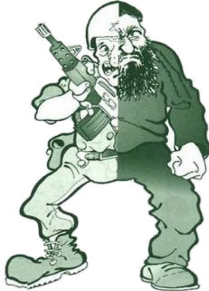
Caricature of an “evil” Israeli soldier, merged with a caricature of a Diaspora Jew, reminiscent of prototypical European anti-Semitic cartoons. The caption is “The Criminal Jews” ( Issue 10, June 2003 ).

impurity of the Zionist Jews ( Issue 47, March 1, 2005 ),” “...evil Zionists who do not have even one grain of culture in them ( Issue 63, November 1, 2005 ).”