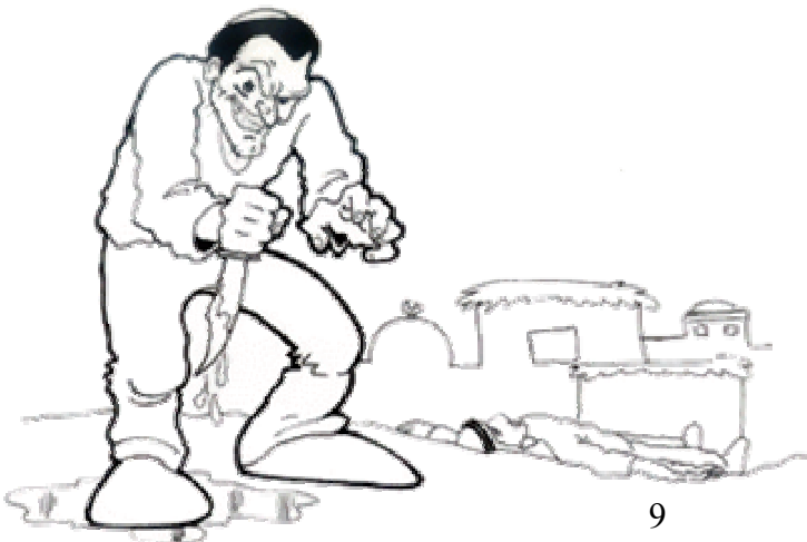
An Al-Fateh drawing showing an Israeli in the 1948 war (War of Independence) seeking to spill Arab blood