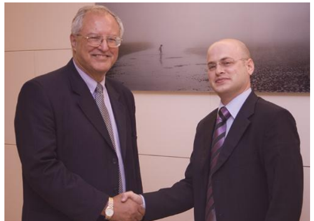
Presentation at FAES