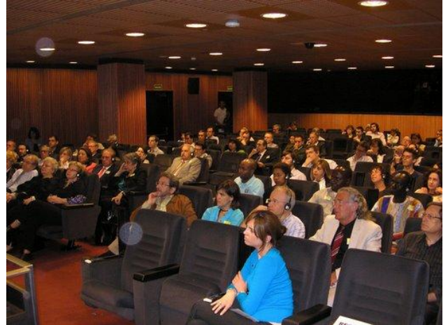
Congreso de los Diputados