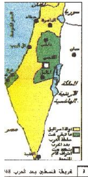
“The State of Israel”

Social Sciences: History, Geography, Civics, Grade 9 (n.d.) p. 89