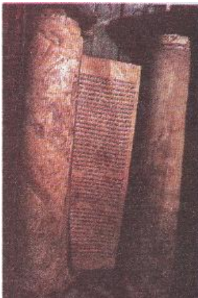
نسخة قديمة من التوراة بحجرية