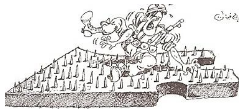
“لا راحة للمستعمر فوق الأرض المحتلة”

Philosophy, Grade 12 – Humanities (2007) p. 240